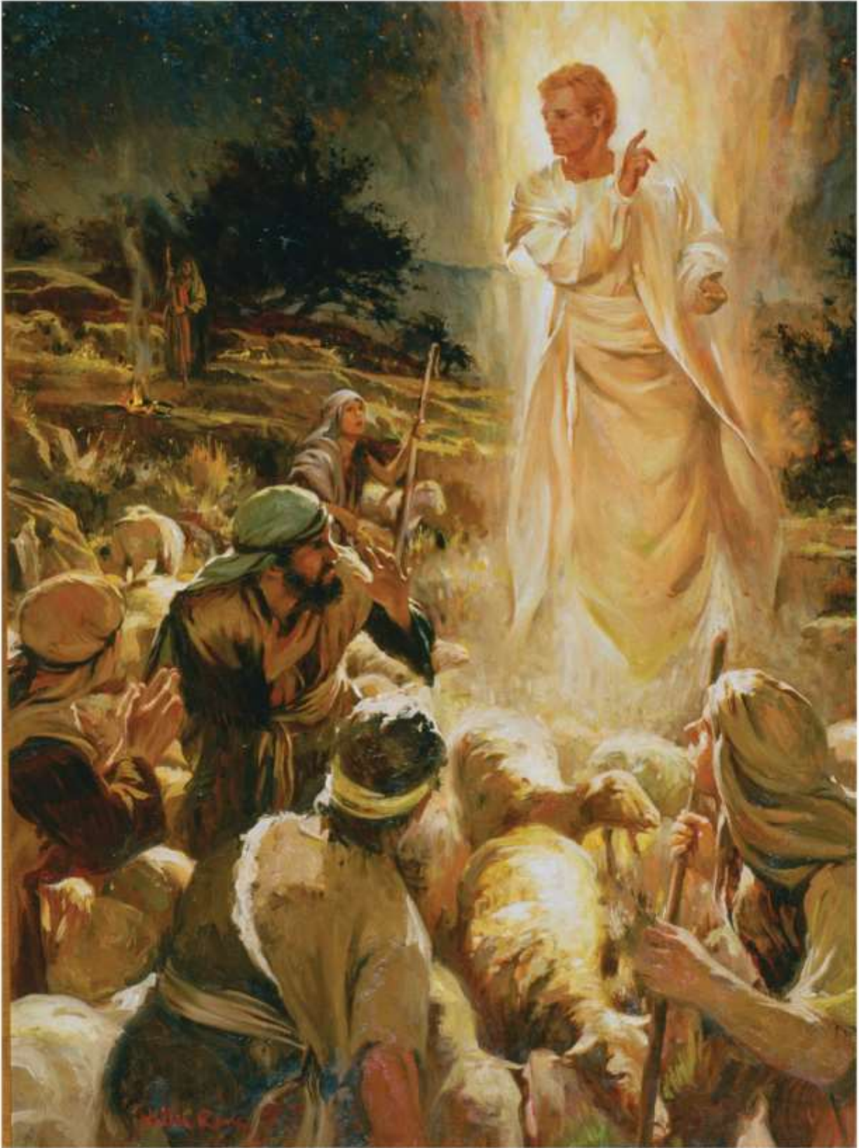
Good Things of Great Joy (The Angel Appears to the Shepherds), by Walter Rane, courtesy Church History Museum